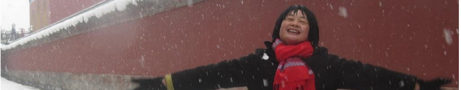
Snow Covered Temple of Heaven, Beijing by i a walsh via Flickr.