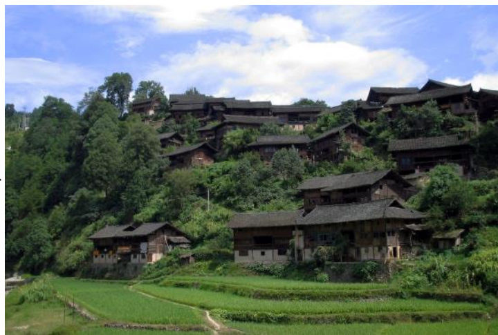
Lang De

A second teaching that is important for us regards two kingdoms. We tend to describe life as one-kingdom people, where everything belongs