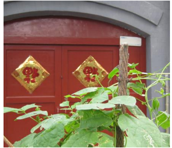
福到

“In everything I did, I showed you that by this kind of hard work we must help the weak, remembering the words the Lord Jesus himself said: ‘It is more blessed to give than to receive.’” (Acts 20:35) These words of Jesus, as relayed to us by the apostle Paul, seem to be just the op-