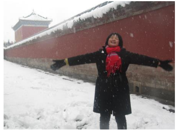
Snow Covered Temple of Heaven, Beijing by i a walsh via Flickr.

Matthew 6:20 reads: “Store up for yourselves treasures in heaven, where neither moth nor rust destroys, and where thieves do not break in or steal.” The Lord tells us that heaven has its own “First National Bank,” where we can invest for eternity. Paul wrote: “Not that I seek the gift itself, but I seek for the profit which increases to your account.” (Philippians 4:17) Each of us has an account in heaven that we will be able to enjoy for eternity. Although it is true that we “can’t take it with us when we die,” Scripture teaches that we can make deposits to our heavenly account before we die.