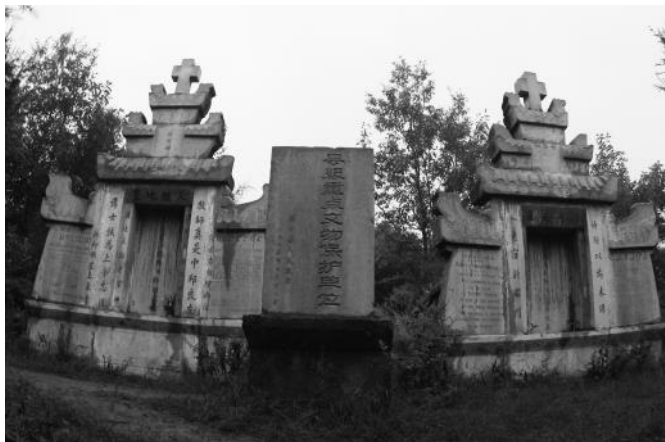
Samuel Pollard's memorial by Mr. ZhiHuang

Pollard promoted education in the Miao villages. In Wumeng, he constructed the first up-to-standard Chinese running track and field stadium, the first swimming pool with separate male and female lanes, the first football team, the first leprosarium in the nation, and the first hospital in southwest China. Most important was the general rise in educational level. A census done after the war in 1946 indicated that out of 100,000 Han, 2.19 were college students. Out of 100,000 Miao, 10 were college students (primarily from Shimenkan district). 1