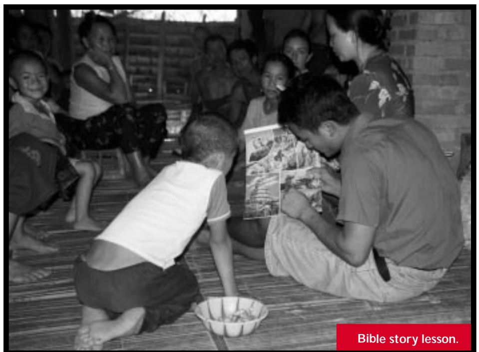
Bible story lesson.