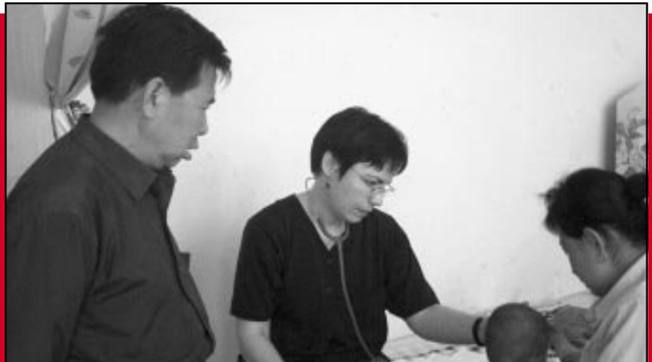
Rural well-baby home care.

• Amity Foundation since the early 1980s has been a channel for outside funding and services from Protestant