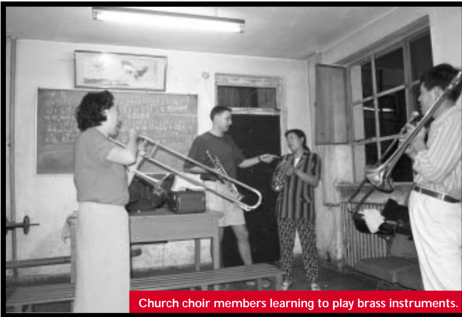
Church choir members learning to play brass instruments.