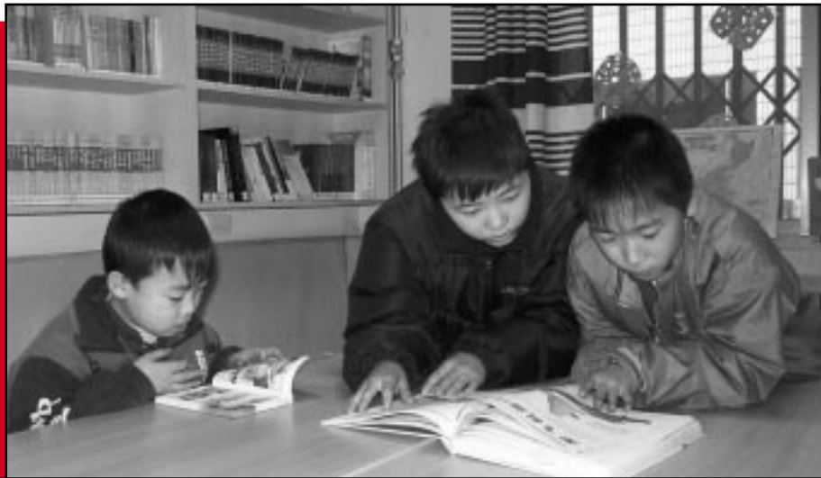
Kids at a community center library.

Some localized efforts have been developed by expatriates responding to warm welcomes where grandparents or parents had served as missionaries. Examples include Evergreen Family Friendship Services in Shanxi Province and Gansu Inc., a US nonprofit that brings ophthalmologists to teach and perform cataract surgery for poor villagers, choosing a different county hospital base each summer. 10