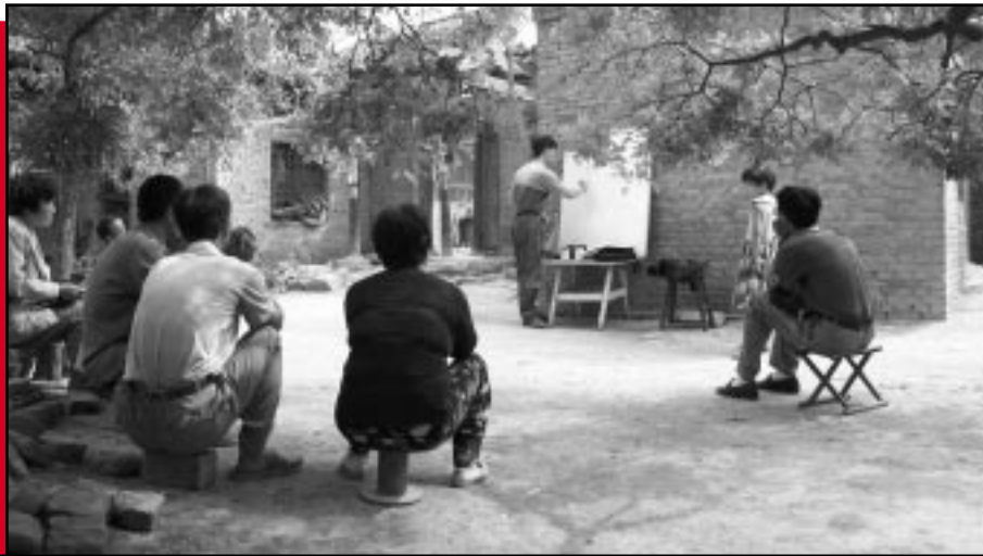
Farmer's work group training session.

Small-scale social service agencies are linked directly to local congregations or religious associations. One interesting example is the Signpost Youth Club affiliated with Ningbo's Catholic diocese in Zhejiang Province. A "virtual" club, it uses the Internet to promote spiritual formation for Catholic youth (ages 18-30) working and studying in different parts of the province. 6